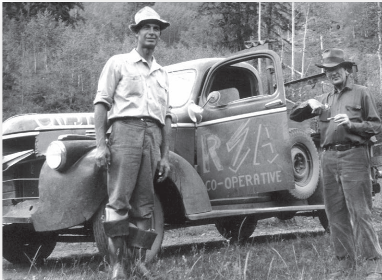
Electrification and living the dream in Gunnison County started 76 years ago.

With new technologies coming all the time we will have many more opportunities to continue living the dream. Here's to new possibilities.